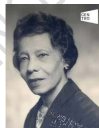
Pura Belpré (1899-1982)