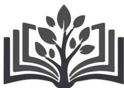
Bibliotecas Escolares de Puerto Rico