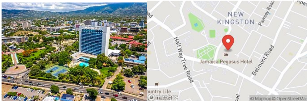
Pegasus Hotel, Kingston Jamaica -81, Knutsford Boulevard, Kingston, Jamaica